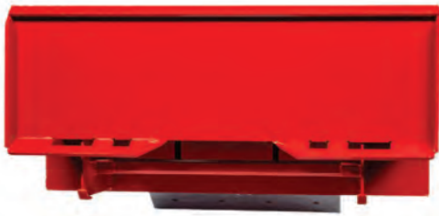
Quick Attach Mounting System