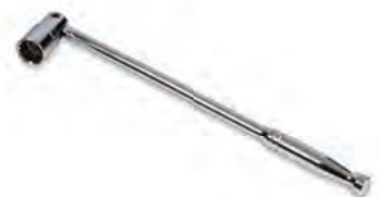
Socket Breaker Bar