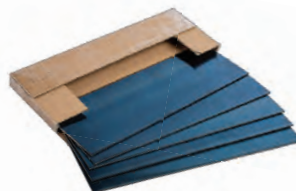
Sample Pack of Blades