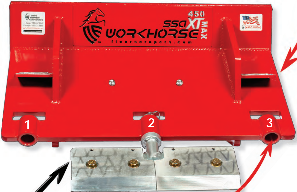
24" Rotating Blade Holder