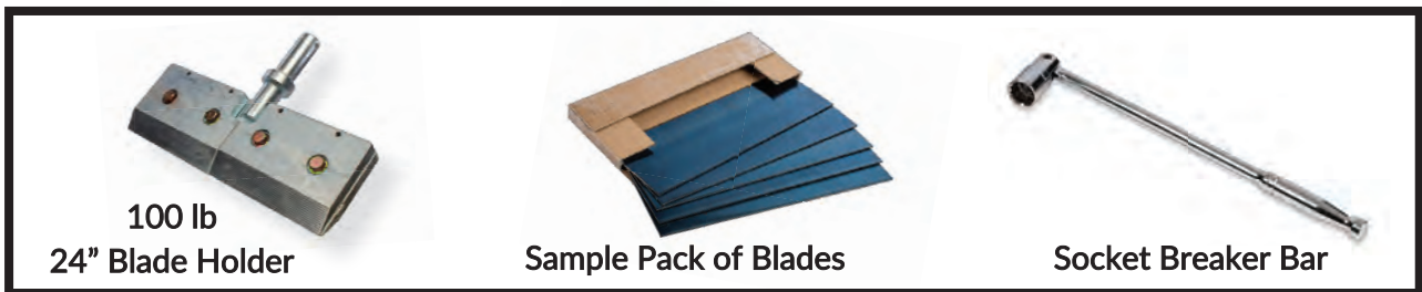
100 lb 24" Blade Holder